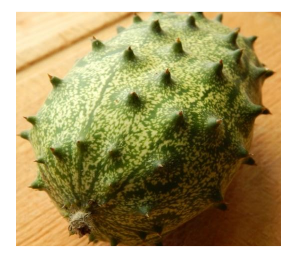
Fig. 1. Kiwano fruit

Kiwano (Cucumis metuliferus) is an annual climbing herb that grows naturally in the tropics. It is found in Nigeria, South Africa and other tropical areas. It belongs to Cucurbitaceae family [9]. It is commonly called horned melon. The seeds and the pulp are consumed for nutritional and therapeutic purposes. The seeds are ground to powder and used for treatment of parasitic infections. The pulp has been reported to be rich in various nutrients and phytochemicals [9]. The rind which is mostly removed as waste has been shown to contain various nutrients and phytochemicals making it a potential source of therapeutic compounds. With these information, it is expedient to explore the rind for possible therapeutic use as this will stimulate interest in its utilization and hence, minimize waste in the environment. Therefore, this study was aimed at evaluating the composition of some vital bioactive compounds and further investigate the antioxidant and anti-inflammatory effects of the rind.