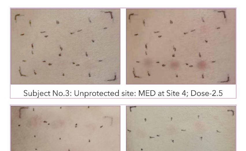
Subject No.3: Standard site: MED at Site 4; Dose-37.5 (SPF-15)

A total of 12 subjects were screened and enrolled, ten subjects had the desired Fitzpatrick skin type III and two with skin type IV. 10 subjects completed the study and two subjects were lost to follow up. There were no adverse effects recorded. The subjects showing SPF value of standard as 15\% \pm 17\% were considered as a valid subject for data consideration, and all the 10 subjects were found to be valid. The mean in vivo SPF of the pterostilbene cream was found to be 6.20 \pm 1.30 as shown in Table 4, and individual SPF values ranged from 4.52 to 8.84 from the 10 valid subjects (Figure 3).