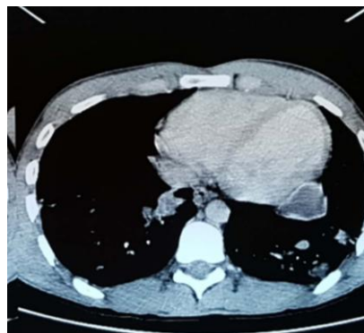
Fig. 7. Thoracic CT scan. Cystic formation at the level of the cardiophrenic recess of 2 cm