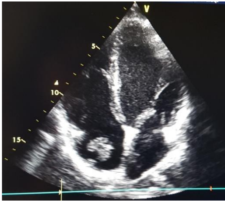
Fig. 8. TTE cardiac ultrasound: Cystic formation in the right atrium