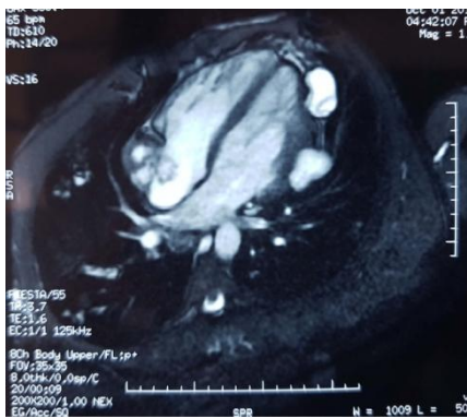
Fig. 10. T2 cardiac MRI: Cystic formation in the right atrium in close contact with the tricuspid valve and two other pericardial cystic formations opposite the left ventricle

In total, there were three cardiac hydatid cysts, one in the right atrium and two in the pericardium opposite the left ventricle, associated with multiple pulmonary hydatidosis. The patient was put on an antiparasitic treatment with