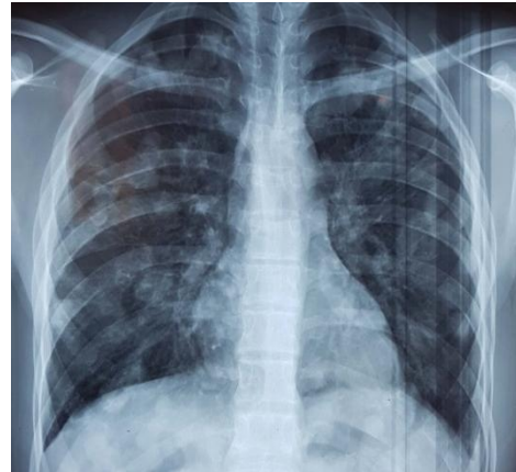
Fig. 5. Chest radiograph. Bilateral nodular opacities showing balloon release

(Fig. 10) confirmed the presence of a well-limited cystic formation in the right atrium, located in an area of hyposignal, measuring 40 x 22.5 mm, which came into intimate contact with the tricuspid valve, and two other pericardial cystic formations opposite the left ventricle, the largest measuring 33.5 x 27 mm. Abdominal ultrasound did not show any hepatic involvement and brain CT was normal.