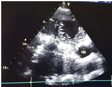
Fig. 9. TTE cardiac ultrasound: Cystic formation in contact with the posterior wall of the left ventricle