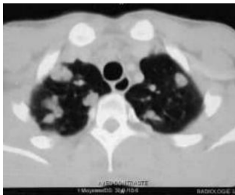
Fig. 1. Chest CT scan. Multiple nodular opacities and bilateral cystic formations

Bronchoscopy showed no bleeding or hydatid membranes and the search for scolex in the bronchial aspiration fluid was negative. Abdominal ultrasound and brain CT scan did not reveal any other location of the hydatid cyst. The diagnosis of multiple thoracic hydatidosis with pulmonary, cardiac and pulmonary arterial