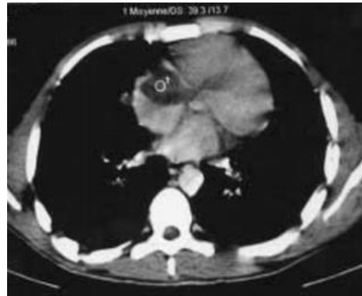
Fig. 2. Thoracic CT scan. Cystic formation of 4 cm in diameter in the right atrium

localizations was retained. A medical treatment based on albendazole was started, at a dose of 800 mg per day in 2 doses. Surgical removal of the cardiac and pulmonary arterial cysts, under extracorporeal circulation, was indicated but unfortunately, the patient died following a sudden hemoptysis.