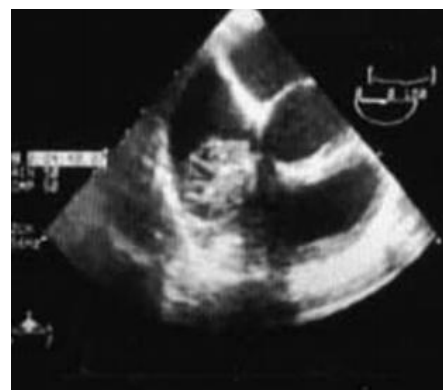
Fig. 4. Transesophageal echocardiography. Multivesicular hydatid cyst on the lower part of the interatrial septum

Bronchoscopy showed no bleeding or hydatid membranes and the search for scolex in the bronchial aspiration fluid was negative. Abdominal ultrasound and brain CT scan did not reveal any other location of the hydatid cyst. The diagnosis of multiple thoracic hydatidosis with pulmonary, cardiac and pulmonary arterial