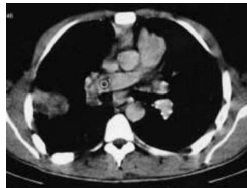
Fig. 3. Thoracic CT scan. Cystic formation of 2 cm in diameter in the right pulmonary artery