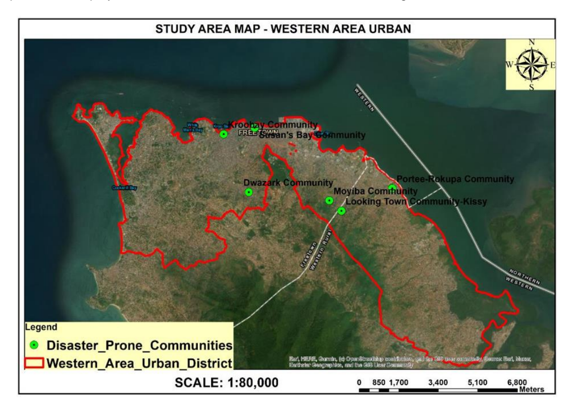
Fig. 2. Study area

Sierra Leone, situated on the West coast of Africa along the Atlantic Ocean, faces a high risk of flood disasters due to its geographical characteristics, tropical monsoon climate, and annual torrential downpours. Various factors, including unplanned housing development, the impacts of climate change. inadequate infrastructure, deforestation, and poorly designed drainage systems, have heightened disaster risks, with Freetown, the capital city, being particularly vulnerable. The city's susceptibility to flooding is amplified by its geographical constraints, as it is encircled by highlands with limited space for expansion, forcing communities disadvantaged to reside vulnerable areas like wharves and coastal zones, as indicated in Fig. 2 below.