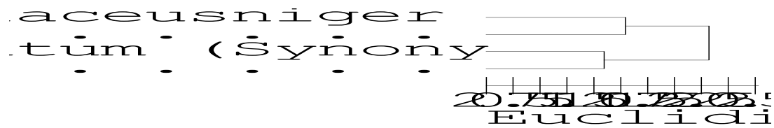
Fig. 3. Dendrogram