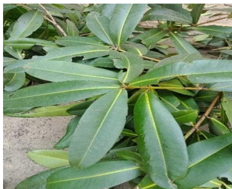
Plate 1. Vegetative branch of M. suriga