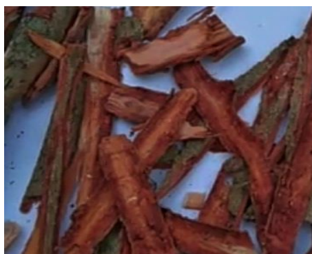
Plate 2. Bark of M. suriga