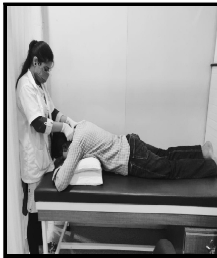
Fig. 3. Oscillatory Mobilization on cervical spinous process