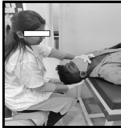
Fig. 4. Mckenzie retraction neck exercise