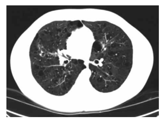
Figure 2. Axial chest CT image showing diffuse cystic lesions with scattered micronodules