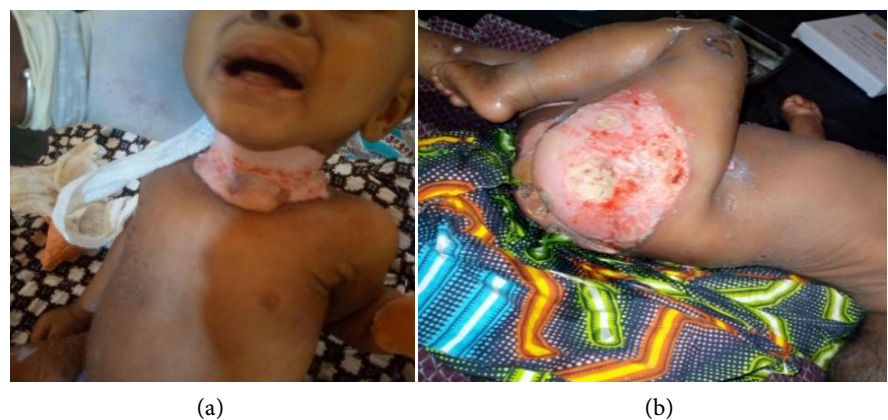
Figure 3. (a) Necrotic ulceration on the neck 15 days after administration of Zinc sulfate; (b) Necrotic ulceration in the buttocks 15 days after administration zinc sulfate.