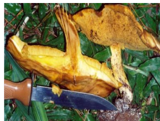
Suillus granalutus ,