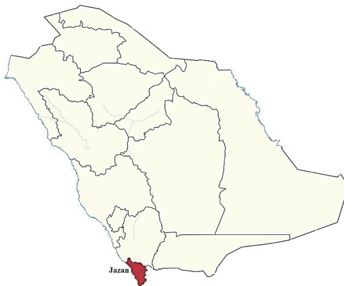
Figure 3. Jazan province location

Briefly, this system classified the selected factors for risk analysis into two main types: the factors of failure hazard (Hazard) and the factors of the failure impact (Impact or Consequences). Furthermore, the factors of failure hazard are classified into four groups: slope factors, climate and water factors, rock type factors, and discontinuity factors. In contrast, the factors of the failure impact are classified into three groups: slope factors, ditch factors, and road factors. In addition, it used a failure hazard rating scale for each factor ranges from 2 (the minimum value) to 16 (the maximum value) as 2, 2 2 , 2 3 , and 2 4 . As a result, a total of four categories of hazard degree are identified (2, 4, 8, and 16). For the degree of the impacts (the consequences), it classify them into five categories of risk levels: low (L), low to medium (L-M), medium (M), medium to high (M-H), and high (H).