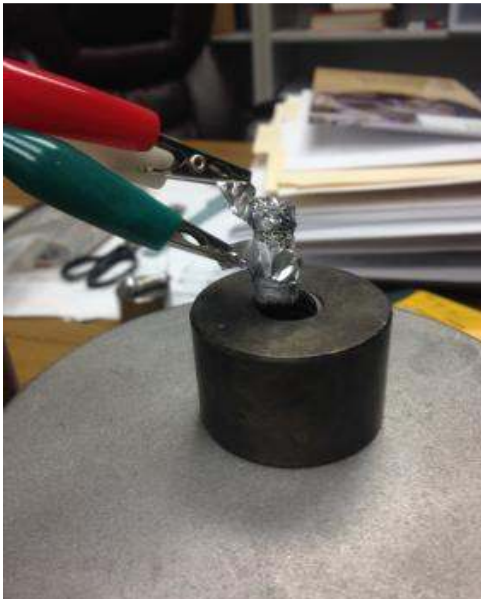
Fig. 2. Porous metal on heat plate

After the manufacturing, the material was once weighed again, before the ends of the sample were wrapped in aluminum as electrodes to be analyzed by a CH Instrument electrochemical analyzing instrument. The top and bottom ends of the sample were connected through banana clips (as shown in Fig. 2) and that were connected to the machine which outputs its results onto a computer. Once ready, sample was set on a steel block that was set on a plate heater as the steel block allows for slower temperature changes and easier adjustments for the testing. The sample was then heated to 26°C and held for 5 second to collect data. Once that was completed, it was raised to 28°C, and 29°C etc. The test was repeated at each degree level three times. After that, other samples were tested as well as comparisons to the sample that was created in the characterization experiment.