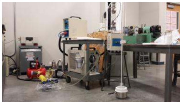
Fig. 1. Experimental setup prior to melting the aluminum alloy

After the molten alloy solidified, the tube was cut in order to extract the porous metal. Water was used to dissolve the salt from the cast. The metallic sample was then dried as the final step of the manufacturing experiment.