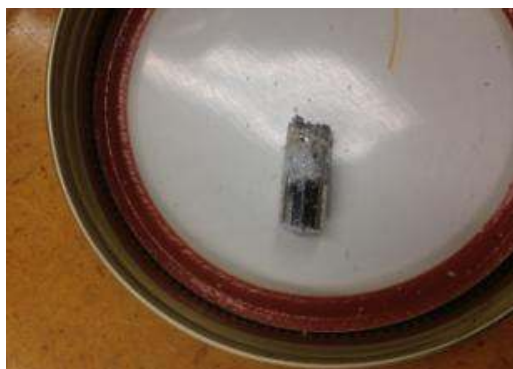
Fig. 3. Optical image of the porous material