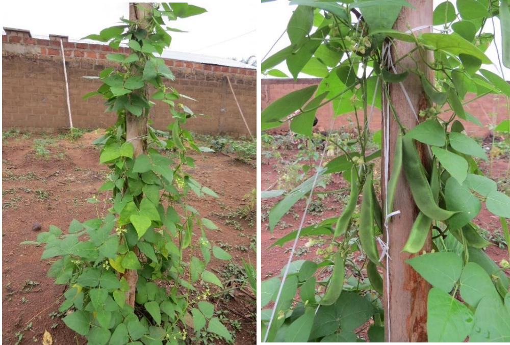
Fig. 1. Photos showing two P. lunatus plants wrapped in support (left: flowering plant; right: fruiting plant)

The taxonomic position of accessions was determined as botanical species and varieties using Flores and other taxonomic documents [15-18]. The morphological characteristics of the plants at various stages of their development made it possible to develop the key for determining the taxa considered as Phaseolus lunatus in Benin by local populations.