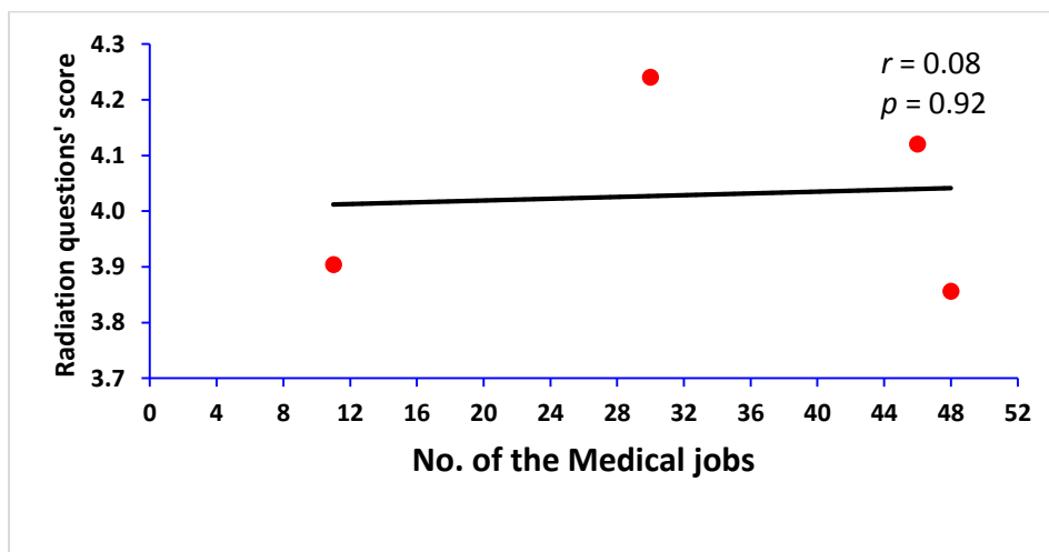
Fig. 3. Correlation between the average radiation questions' score and the No. of medical jobs

Most of the imaging methods used in radiology departments were identified in the questionnaire questions in this study. The questions were designed to fit the objectives of the current study and to measure the mechanism by which patients distinguish between different types and the nature of radiation.