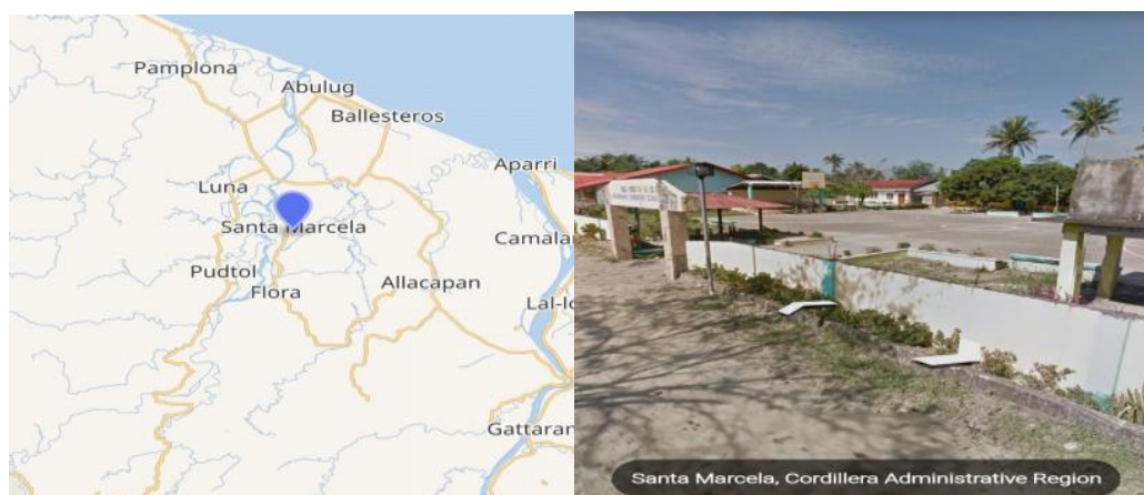
Fig. 2. This figure shows the locale of the study