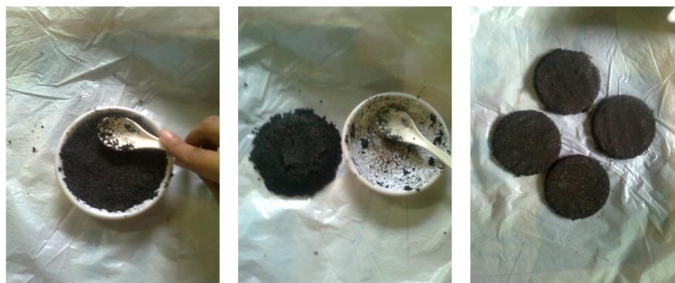
Fig. 2. Preparation of mosquito repellent cakes