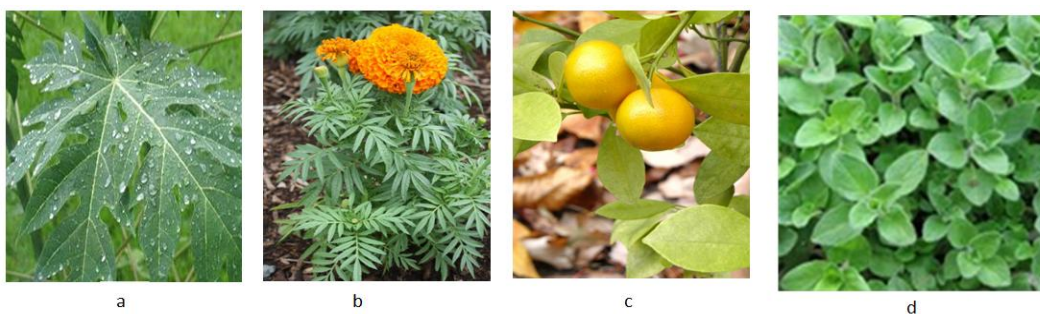
Fig. 1. Papaya (a), Marigold(b), Calamondin(c), Oregano(d), plant leaves used for preparation of mosquito repellent cake

Evaluation was carried out in a net cage (45 cm×30 cm×25 cm) containing 100 blood starved mosquitos. They were subjected to evaluation process by counting the mosquitos' death rate, landing and baiting of mosquitos. The results are summarized in Table 2. The mosquitos used in this experiment were caught using a net while biting humans between 7 pm and 10 pm. Mosquitos were starved for 24 hours and placed in the cage (45×15×30 cm). Test timing was between 7 pm and 10 pm since the mosquitos typically bite at night. The percentage repellency rate with respect to different natural binder is as shown in Fig. 2.