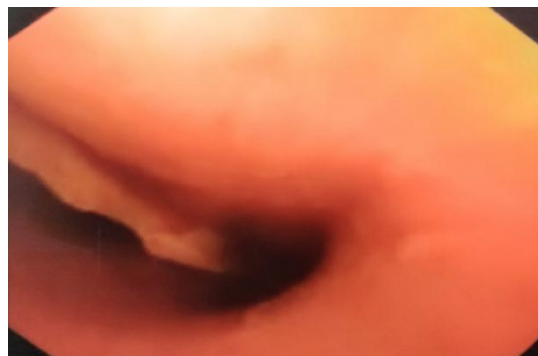
Fig. 2. Bronchoscopic view of foreign body obstructing right main bronchus

difficulty (Fig. 3). The patient was shifted back to PICU for observation. Patient was extubated same day and shifted to the ward to continue medical treatment. Two days later she was discharged home.