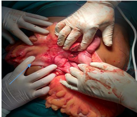
Fig. 2. The peritoneal cavity with the bowel loops seen herniating through the fossa of waldeyer