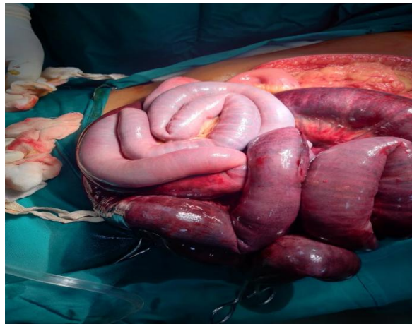
Fig. 3. Zone of vascular transition seen at proximal jejunum