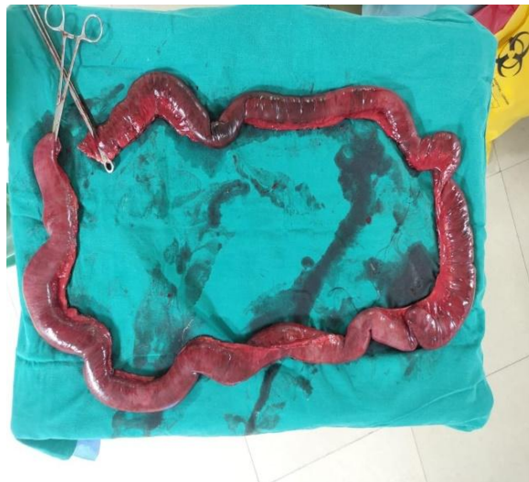
Fig. 4. Long segment small bowel resection