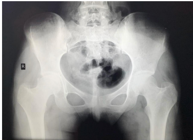
Fig. 1. Pre operative X-ray