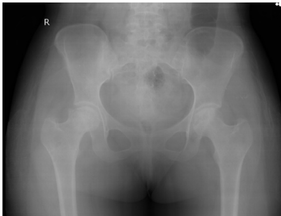
Fig. 2. Post operative X-ray