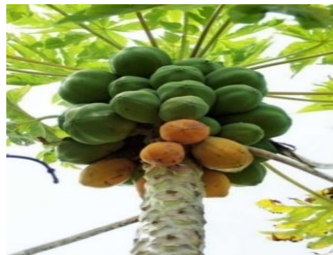
Fig. 1. Carica papaya