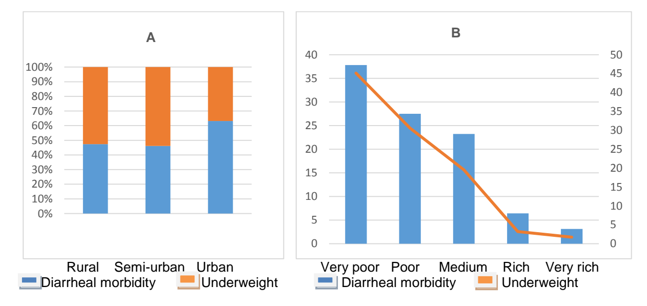
Fig. 1. Distribution of the child's state of health according to place of residence (A) and according to the standard of living of the household

Table 3 highlights the results of the estimation of the instrumental variable probit model. It will therefore be a question of illustrating the effect of access to the public water service on the state of child health by distinguishing between the two measures, in particular diarrheal morbidity and underweight.