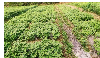
Fig. 3. Irrigation 35DAS at flowering