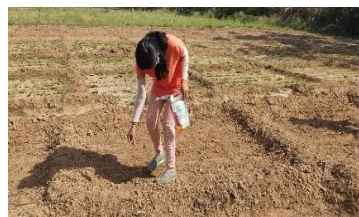
Fig. 2. 20 cm×10 cm line Sowing