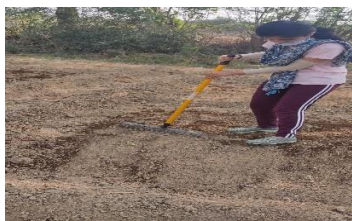
Fig. 1. Mixing of vermicompost

The data on number of nodules per plant at 60 DAS, influenced by different treatment in green gram presented in Table 2. The highest number of nodules (10.03/plant) were observed in 30 cm × 10 cm + 5 t/ha VC + 12% VW + 5 kg/ha FYM + 12% J at 40 DAS and lowest number of nodules (8.87/plant) was observed in 20 cm × 10 cm + 4 t/ha VC + 10% VW + 10% J at 20 DAS. The development of nodules populace is can be because of the symbiotic affiliation of rhizobium microorganism and the utility of organic manures would possibly have more suitable the populace of favored microbes with inside the root region throughout the early level of contamination via way of means of improving the physical, chemical and biological of properties of soil. Higher population of the desired organisms will always have greater possibilities of infection and consequently formation of more healthy and effective root nodules having higher amount of leghaemoglobin and thus increases the nodule population [11].