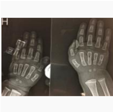
Fig. 3. Radiography before treatment