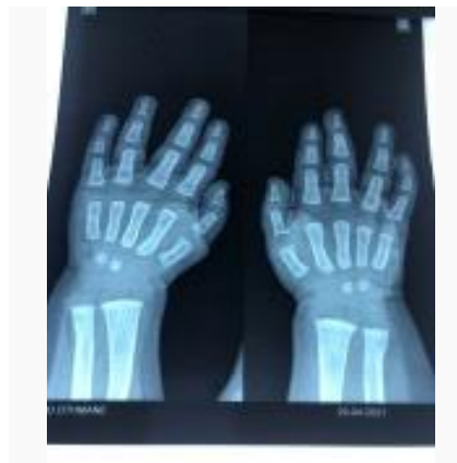
Fig. 5. Radiography after treatment