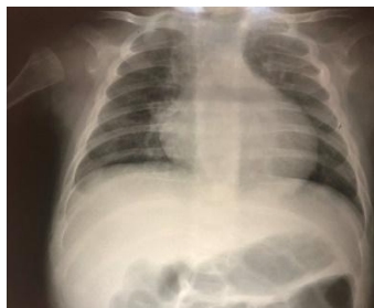
Fig. 1. Chest X-ray

The dosage of electrolytes revealed hypocalcemia at Ca^{+}=46mg/l with a corrected Calcium=62 mg/l and normal phosphorus at 62 mg/l. Before this clinical and paraclinical picture. We thought of rickets by a deficit in Vit D, the corrected calciuria decreased, and the 25 OH Vit D decreased by seven ng/ml, parathormone increased by 120 pg. Increased alkaline phosphatase of 821 U/l. The wrist x-ray showed bony signs of rickets (Fig. 3). The vitamin D dosage in the mother is less than eight ng/ml. The diagnosis of deficiency rickets secondary to maternal vitamin D hypovitaminosis was retained. The patient was treated with calcitherapy in combination with the treatment of heart failure. Once the serum calcium normalized, the patient was put on vitamin D3. The evolution was favourable, and marked by the improvement of the size of the heart chambers, the normalization of the left ventricular ejection fraction (Fig. 4), and the improvement of the radiological signs (Fig. 5). The control PAL dosage showed 256 ui/l.