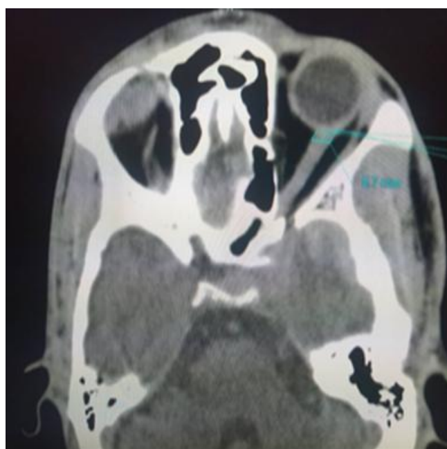
Fig. 2. Axial CT of left temporal lobe contusion with increased ONSD

† significant difference between mean ONSD of generalized and MLS( P=0.021 ), and age, ( P=0.003 ), ‡ No significant difference between mean ONSD of right and left optic nerves( P=0.89 ) and genders( P=0.76 )