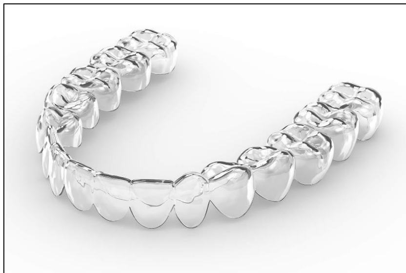
Fig. 2. Transparent clear aligner material

Invisalign aligners were initially produced from a single layer of polyurethane, Exceed-30 (EX30). In 2013, EX30 was substituted by a new polymer, named Smart Track (LD30) a multilayer aromatic thermoplastic polyurethane/copolyester. According to the producer, the new material should provide the aligners with more elasticity and produce more constant forces, improving their clinical efficacy [24].