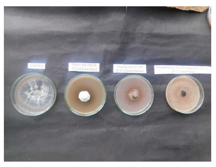
Fig. 2. Efficacy of neem leaf extract and fungicides against finger millet blast pathogen Magnaporthe grisea

Fig. 1. Efficacy of neem leaf extract against finger millet blast pathogen Magnaporthe grisea