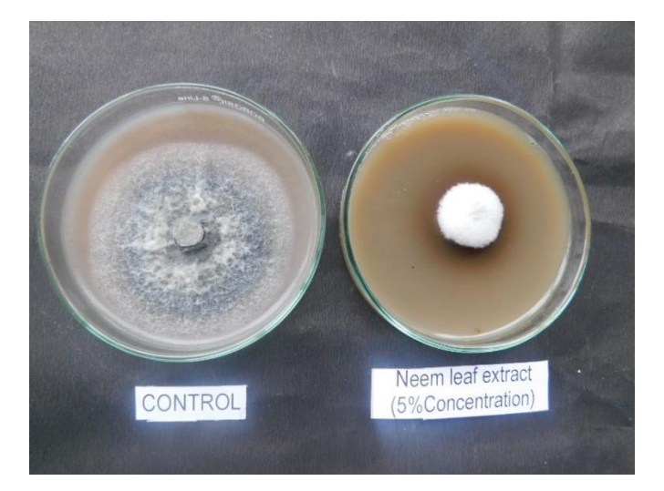
Fig. 1. Efficacy of neem leaf extract against finger millet blast pathogen Magnaporthe grisea