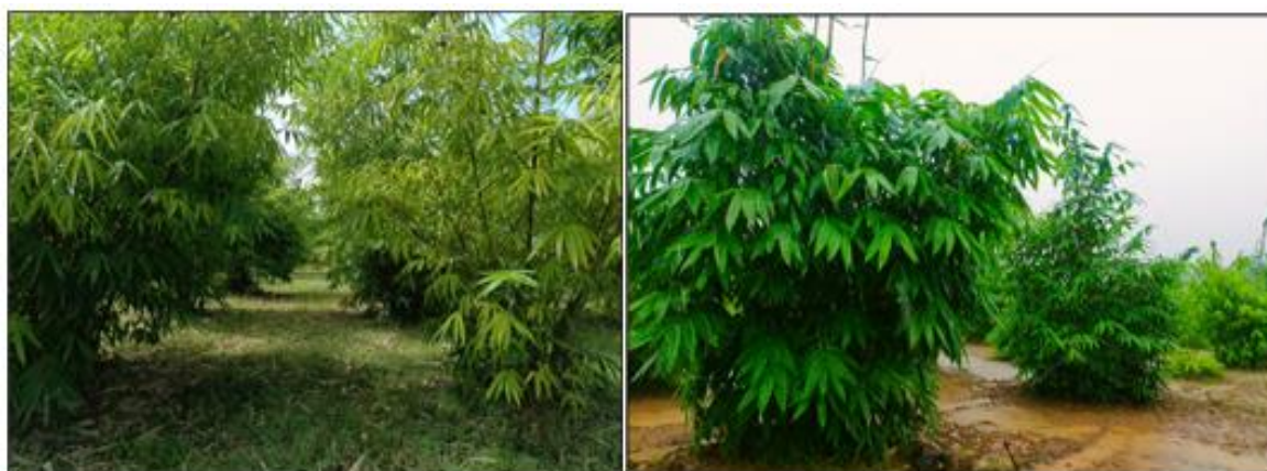
Fig. 1. Plantation of D. brandisii

Thriving in wet evergreen tropical forests, D. brandisii reaches its optimum growth in elevations of up to 1,300 m. While adaptable to various soil types, this bamboo species exhibits a preference for well-drained loamy soil. Its natural habitat encompasses a diverse range of ecosystems, reflecting its resilience and ability to flourish in different environmental conditions. The adaptability of D. brandisii to different altitudes and soil types stresses its ecological versatility and highlights its value in agroforestry practices