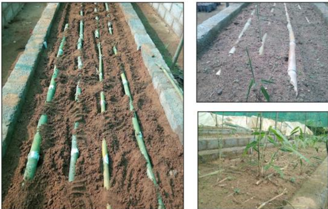
Fig. 2. Planting of D. brandisii cuttings in sand bed for propagation

Rooting can be induced in culm (Fig. 2), branch, and nodal cuttings. Planting two nodal cuttings in suitable media and conditions, with one node exposed outside and another inside the media [6,7,8]. To prevent fungal attacks, the upper portion of the cutting is covered with Parafilm. Additionally, the choice of growth regulators, treatment method, collection time of cuttings, and the culm part (base, middle, or top) are critical factors influencing the process across different species.