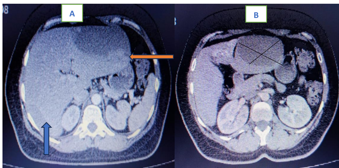
Fig. 2A-B. Transverse cross section of the abdomen passing through T4: showing a spontaneous subcapsular hematoma of the liver affecting the II, III, IV, VI and VII segments (arrows) measuring 160x57mm wide.

electrolytes assessment were normal. Abdominal ultrasound shows subcapsular hematomas of the liver next to segments II, III, IV, VI and VII. For more precise diagnostic, an abdominal CT scan performed revealed a hepatic subcapsular collections next to segments II, III, IV, VI and VII in favor of hematomas with perfusion disorder of segment IV measuring 160x57 mm at its widest length (Fig. 2).