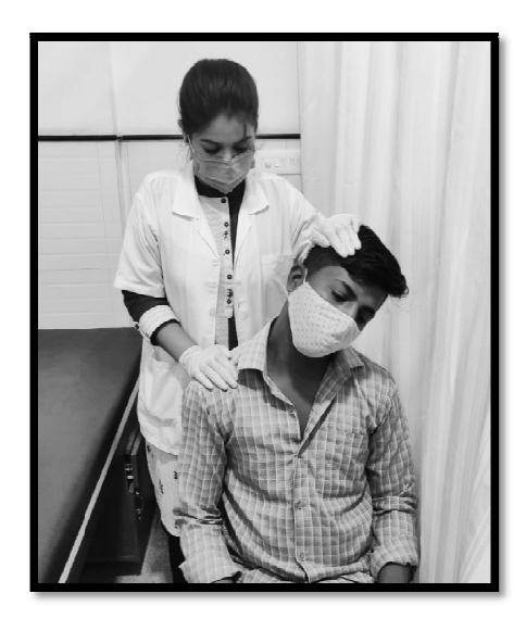
Fig. 2. Stretching of upper fiber of trapezius

Deolankar et al.; JPRI, 33(21B): 100-105, 2021; Article no.JPRI.66828