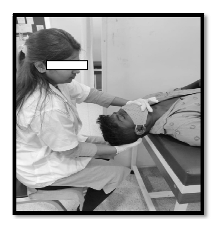
Fig. 4. Mckenzie retraction neck exercise

Deolankar et al.; JPRI, 33(21B): 100-105, 2021; Article no.JPRI.66828