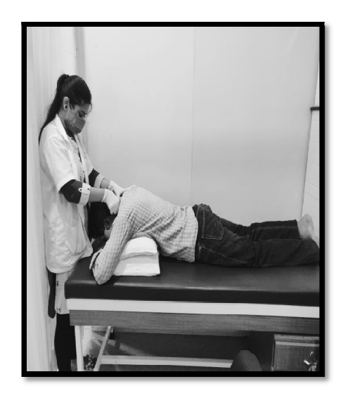
Fig. 3. Oscillatory Mobilization on cervical spinous process