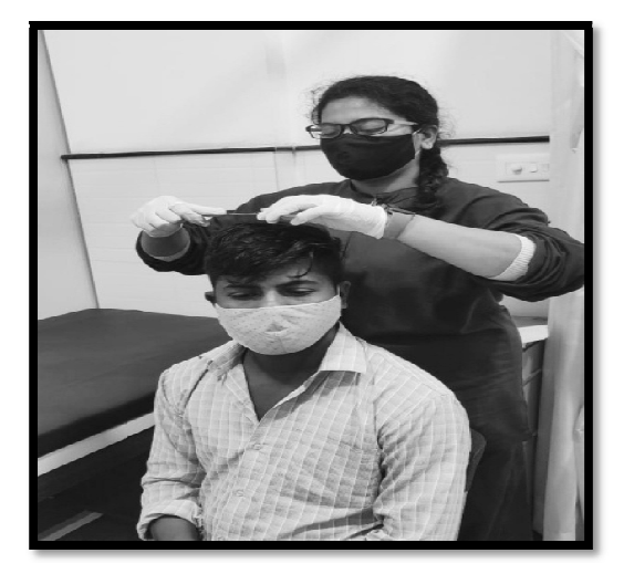
Fig. 1. Cervical side rotation ROM measured using goniometer

The Scapular muscles featured weakness bilaterally. In both limbs; biceps, triceps and deltoid muscles evidenced no strength deficits and shoulders featured a full range of motion. Cervical muscles in pre-treatment MRC muscle power graded 4. Spurling test and distraction test were positive. On neurological examination, sensory proprioception and deep tendon reflexes were physiological bilaterally yet the examination of bilateral upper trapezius, scalene, and levator scapulae revealed spasms and tenderness.