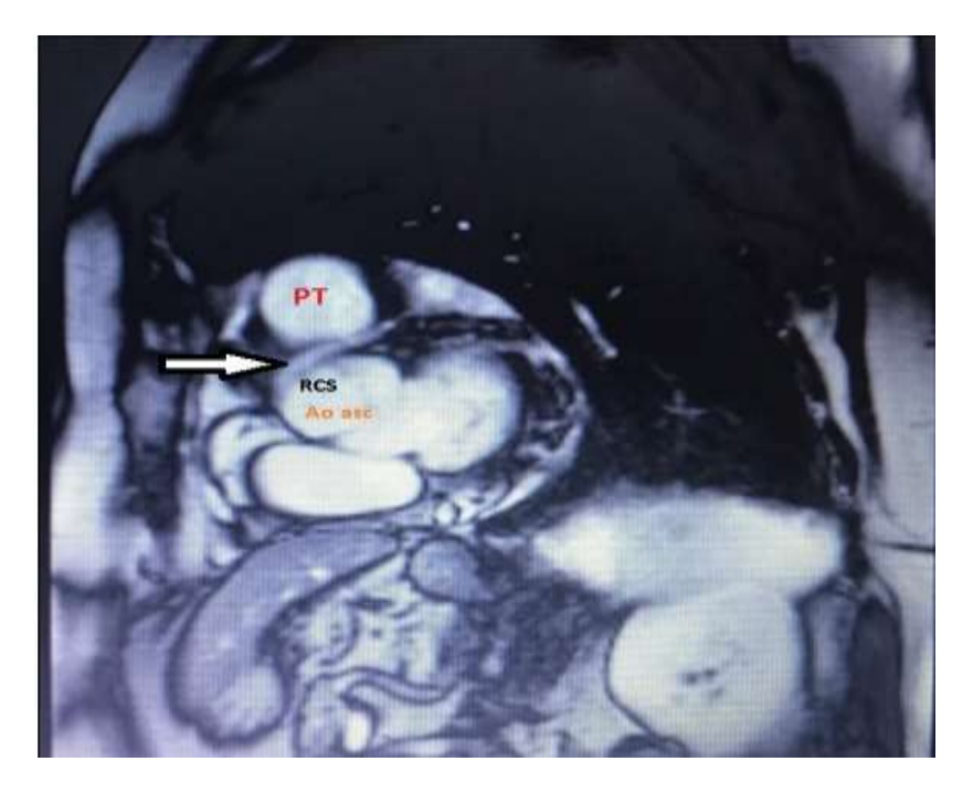
Fig. 2. The coro-MRI sagital plane, showing the origin of the left coronary artery from a common trunk with the right coronary artery from the right coronary sinus and describes a malignant inter-aorto-pulmonary path

Naaim et al.; Asian J. Cardiol. Res., vol. 6, no. 1, pp. 414-419, 2023; Article no.AJCR.109172