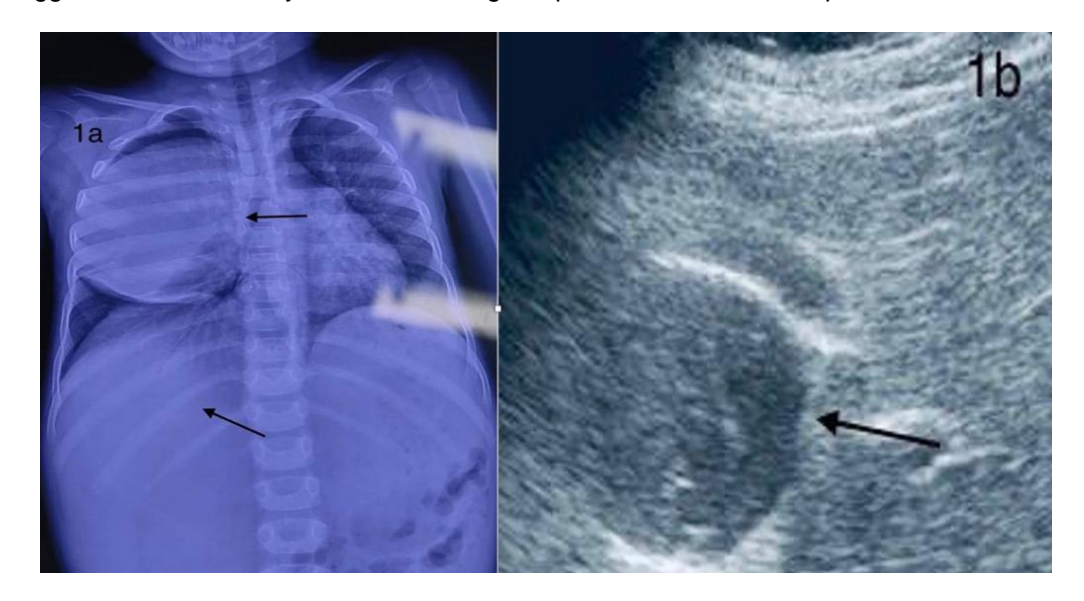
Fig. 1a. Chest X-ray revealed a large dense round well demarcated opacity involving the right lung field and opaque homogenous zone of cyst in right upper abdomen (marked by arrows), Fig. 1b. Ultrasound abdomen revealed well defined unilocular cystic lesion with internal echoes and no internal septations (marked by arrow)

Ultrasound abdomen revealed well defined unilocular cystic lesion 12X10X9 cms with internal echoes involving right lobe of liver and no internal septations (Fig. 1b). Based on chest X-ray and ultrasound abdomen findings contrast enhanced CT scan of chest and abdomen was done, that revealed hepatomegaly with large thin walled fluid filled cystic lesion of size 10.4X9X10.2 cms involving segment VI & VII of liver. Large size cyst also causing compression hepatic ducts with indentation displacement of 1st part of duodenum. Another similar looking lesion in anterior part of right middle lobe causing splaying of pulmonary artery and veins (Fig. 2). All these findings and low socioeconomic strata of patient suggestive of hydatid cyst involving liver and right lung. Hydatid Serology was also done and came out positive. Child was then admitted and started on oral albendazole (4-5mg/kg/per dose) twice daily. After about a week of albendazole therapy, child started having pain abdomen with increasing intensity. So, decision was taken to explore on elective basis. Liver cysts were operated first in supine position. The edges of the wound and the surface of the liver surrounding the cyst were covered with sponges soaked in Hypertonic saline (10%) povidone-iodine solution (10%) to prevent inadvertent implantation of scolices or a