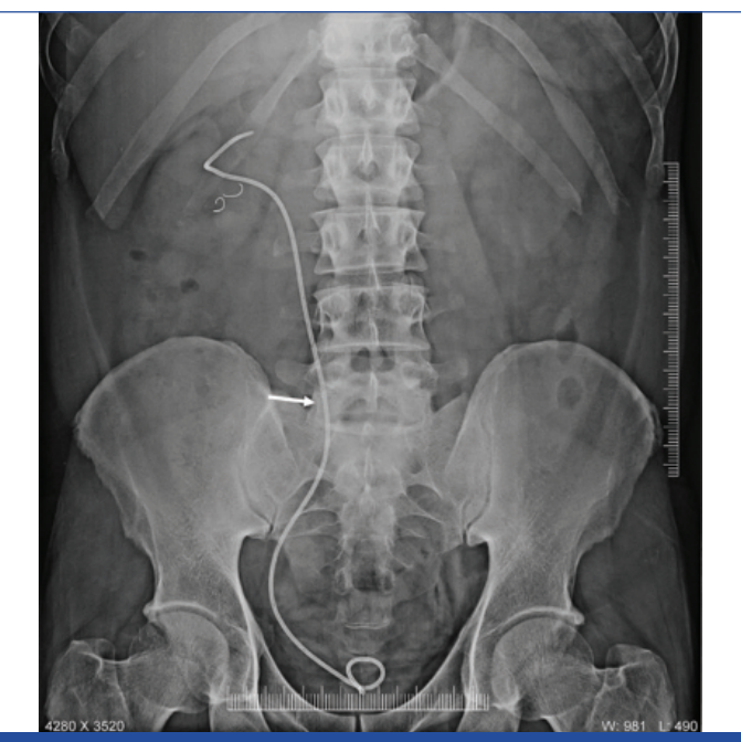
[Table/Fig-4]: Plain X-ray KUB showing complete clearance of calculi using JJ stent in-situ (white arrow).

The patient had an uneventful postoperative recovery and was discharged the next day. His postoperative X-ray [Table/Fig-4] and USG three weeks post the 3<sup>rd</sup> stage, showed complete clearance of calculi with JJ stent-in-situ. The stent was removed after three weeks. X-ray and USG KUB were normal on follow-up done three months after the removal of the stent, and the patient was advised an annual follow-up.