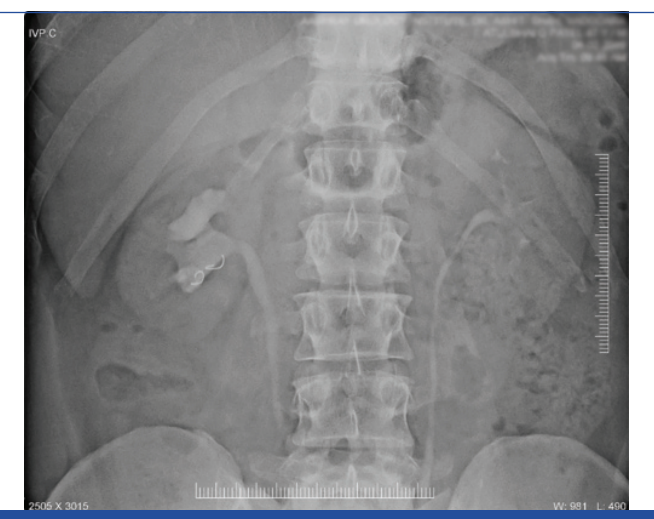
[Table/Fig-2]: Intravenous Pyelogram (IVP) film showing the excreting right and left renal moieties.

bilaterally with calculus in right renal pelvis extending entirely into lower calyx leading to hydronephrosis [Table/Fig-2]. He was advised right PCNL, but this time he did not consent for a repeat PCNL, therefore a staged right RIRS was performed. After proper counseling about the procedure and the need for multiple stages, he underwent the right RIRS as a staged procedure, with complete clearance of calculi after three RIRS procedures.