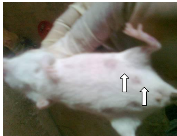
Fig. 1. Mouse injected with Fusarium oxysporum (P6) showing signs of infection

The kidney infected with conidia of Fusarium oxysporum (P191) showed interstitial nephritis with swelling and destruction of the tubules. The tubular lumen was widened. Photomicrograph of kidney infected with conidia of Fusarium oxysporum (H131) showed diffuse toxic tubular damage. The kidney organ infected with conidia of P6 strain showed moderate pyelonephritis.