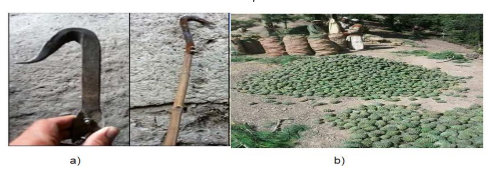
Fig. 2. a) Pine nuts cone removal hook b) Green color cones after collection