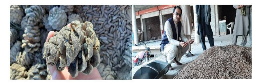
Fig. 5. Cone and kernels of Pine nuts or Chilgoza pine