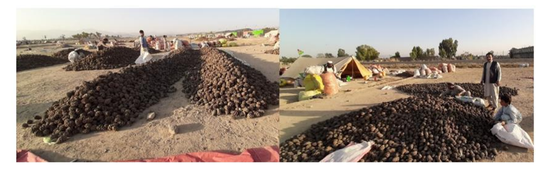
Fig. 3. Pine nuts drying under sunlight; Chilgoza market, Khost

When the cones become fully open, the process of nut extraction become starts. The cones, which are opened, are easy to extract the nuts but the cones, which are not open, are not easy to extract the nuts.