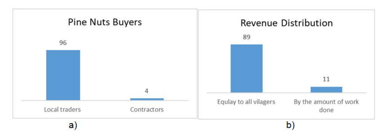
Fig. 6. a) Percentage of Pine nuts purchasers in local villages; and b) distribution of revenue produced from pine nuts among community members