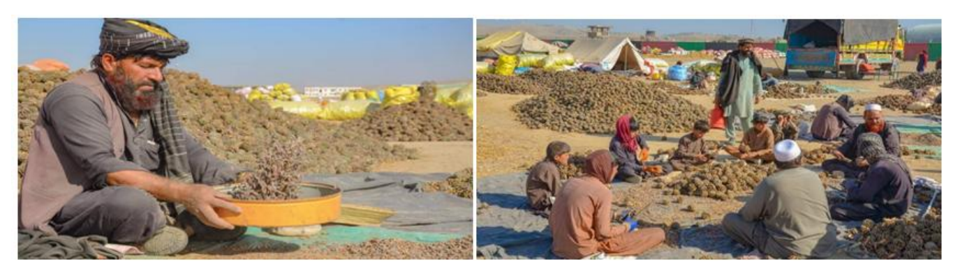
Fig. 4. Nut extraction and cleaning in Chilgoza market, Khost province, Afghanistan