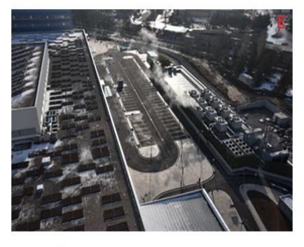
Fig. 4. Some resting areas in hospital open spaces (A: Resting area just front of main entrance, B: Some resting units in hospital garden, C: Open spaces near resting area, D: Bicycle way front of main entrance, E: Open parking area)