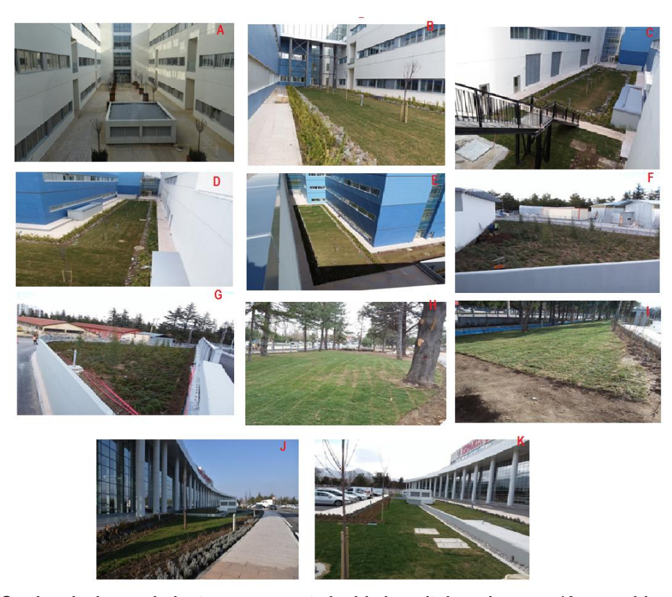
Fig. 5. Garden design and plant arrangements inside hospital garden area (A: movable pots; B, C, D, E: Courtyards in the interstices that connect the main buildings, F, G, H, I: Green corners, Black pine stand, J, K: Main entrance)