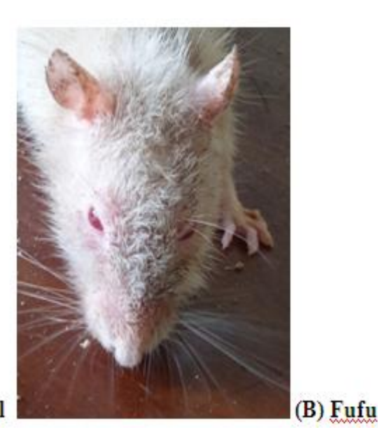
Fig. 1. Comparison of physical appearances in hair loss of control rat and rat fed fufu