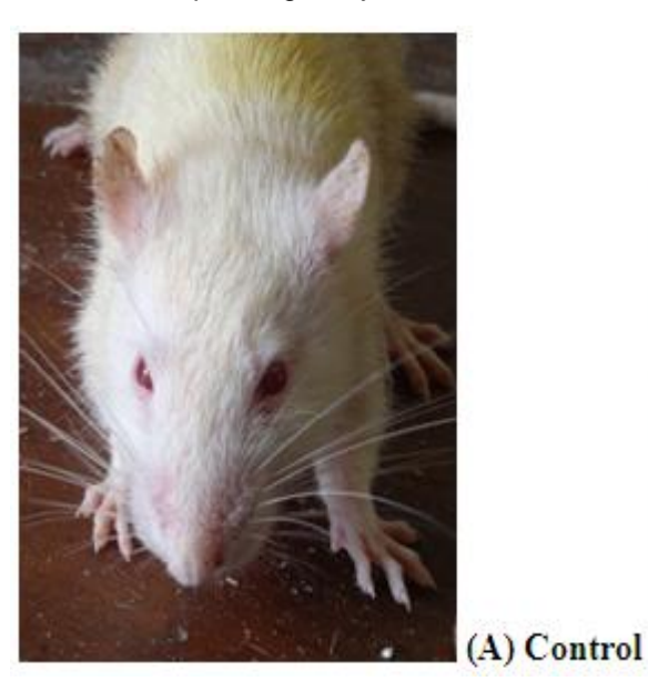
Fig. 3 showed that the administration of fufu affected the performance of the rats as they were not able to effectively aim at the pellets therefore showing aiming impairment. It was observed that the animal used it left limb in reaching for the pellets while the right limb was also raised to support the left limb particularly during grasping. The rats performed poorly than the controls in the reach to grasp experiment due to some amount weakness as a result of the fufu product that was administered.