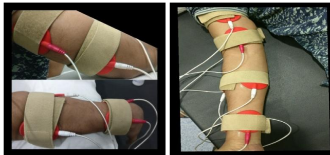
Fig. 1. Electrode placement

Limitation of the study there was no follow after the intervention.