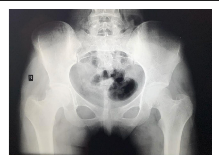
Fig. 1. Pre operative X-ray